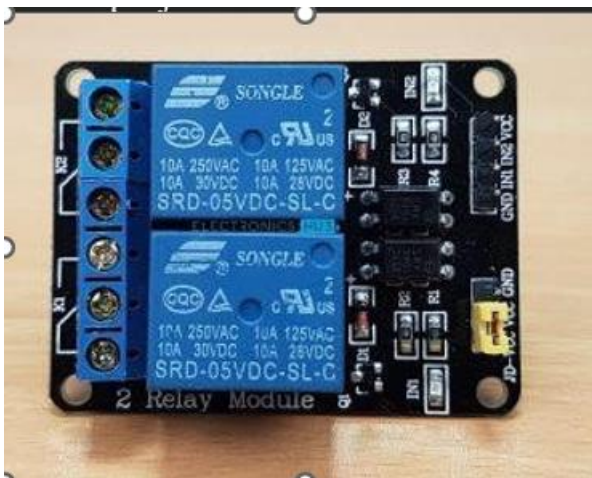
Fig 2: 2 way relay module

A Relay Module is a very useful component as it allows Arduino, Raspberry Pi or other Microcontrollers to control big electrical loads. We have used a 2-channel Relay Module in this project but used only one relay in it. The relay module used in this project is shown below.