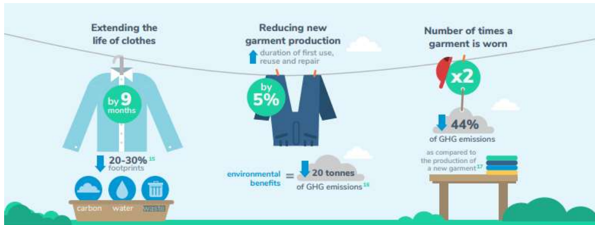
Figure 3. Design and use clothes for longer.