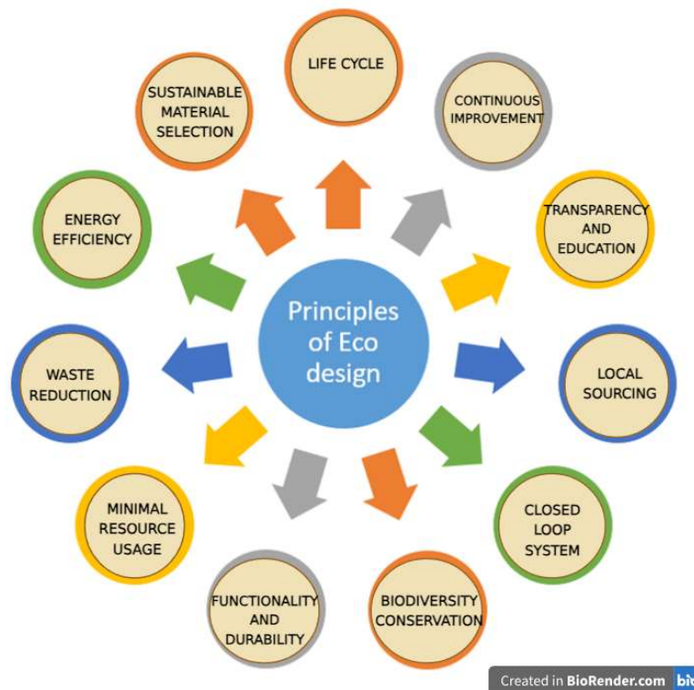
Figure 2. Principles of ecodesign

The principles of ecodesign revolve around creating products, systems, and environments that prioritise sustainability, efficiency, and minimal environmental impact. These principles guide designers and innovators in integrating eco-conscious practices into their work (Fig. 2):