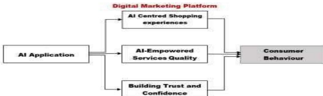
Figure 2; Artificial Intelligence in Digital Marketing in 21 st Century

Source of Data; https://onlinelibrary.wiley.com/doi/full/10.1002/mar.21619