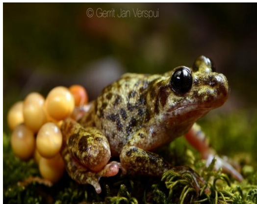
Mallorcan Midwife Toad ( Alytes muletensis ) · iNaturalist Canada