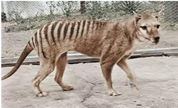
Tasmanian Tiger.