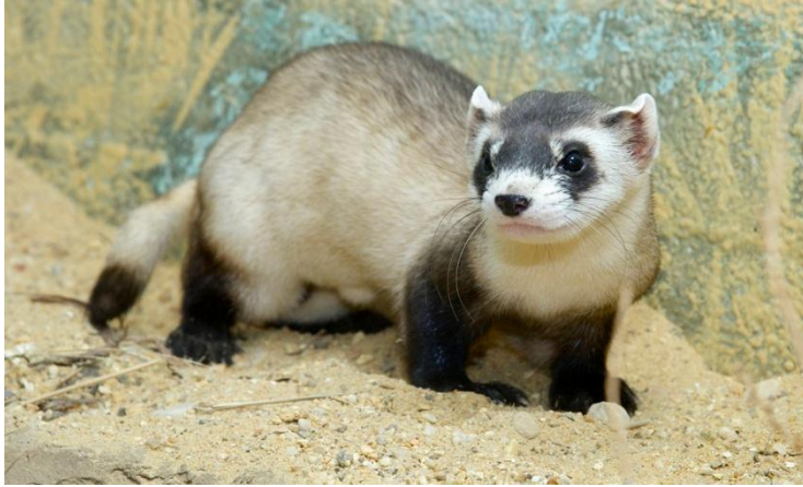
Black-footed ferret | Smithsonian's National Zoo . Creator: Clyde Nishimura | Credit: Smithsonian's National Zoo Copyright: Smithsonian Institution,