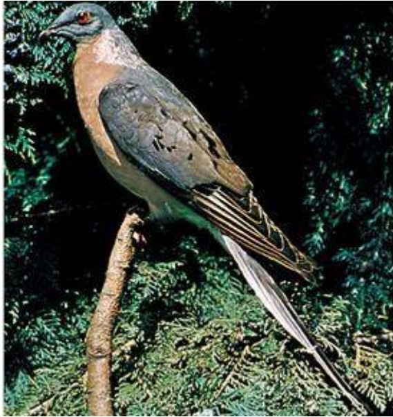
Passenger Pigeons of America

Photo of reintroduced Przewalski's horse taken at the "Seer" release site, managed by the Association pour le cheval de Przewalski:TAKH, in the Khar Us Nuur National Park Buffer Zone