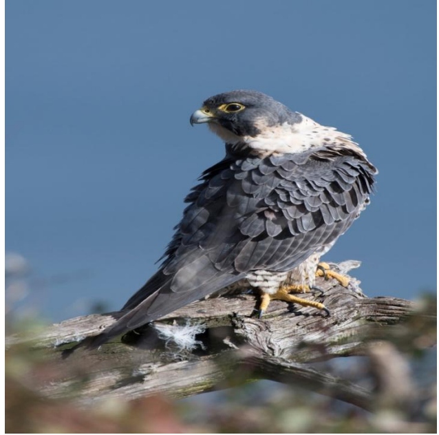
Peregrine falcon, Photo: Mathew Malwitz/Audubon Photography Awards https://www.audubon.org/field-guide/bird/peregrine-falcon