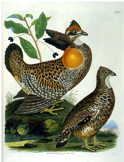
Heath Hen, male & female

https://cdn.britannica.com/98/3398-120-CD959728/Passenger-pigeon.jpg