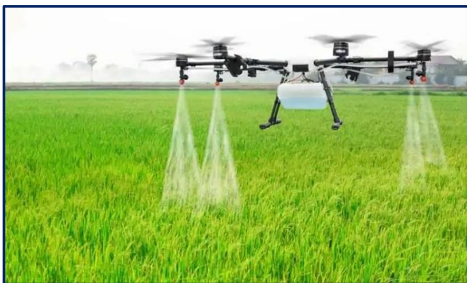
Fig;-6 Drone Spraying Pesticides over crop field

Separate experiment was made to spray different molecules of pesticides are sprayed against different insects and diseases . As a control spray by battery operated knapsack sprayer es adopted. Moreover counts of several defenders and avian population was taken. Pesticides sprayed are of mostly new molecules and having specific target. No adverse effect on defenders and avian population was observed . Pesticide was sprayed at recommended dose in full in terms of gram/ha . It was diluted with 25 liter water per hectare for young plants which did not crossed tillering stage and 40 liter water per hectare at maturity stage. Therefore it was ultra low volume spray. . Recommended dose was not reduced so that pesticide resistance can not get scope to evolve.