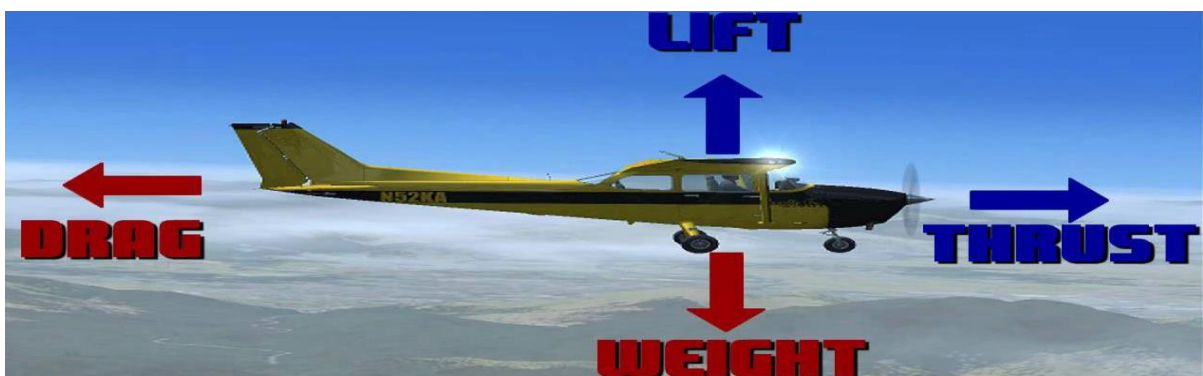
Fig3:- Different forces acting upon air craft

Bernoulli's Principle :- Wind flows over airfoil is faster than the wind flows below the airfoil . According to Bernoulli's Principle , this creates pressure differential between the upward and downward side of the airfoil . As the upward pressure is greater , it lifts the aircraft/drone upward.