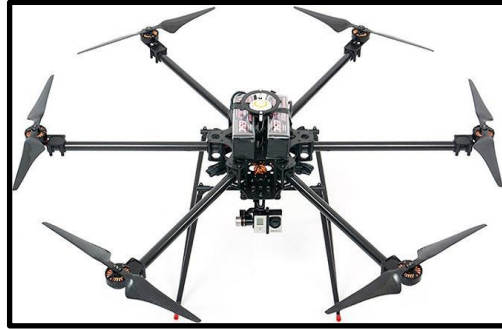
Fig2: Rotor craft Drone(Helicopter Like)

Agricultural Drones are of small/Medium type . It includes tanker having capacity of 10 liter .