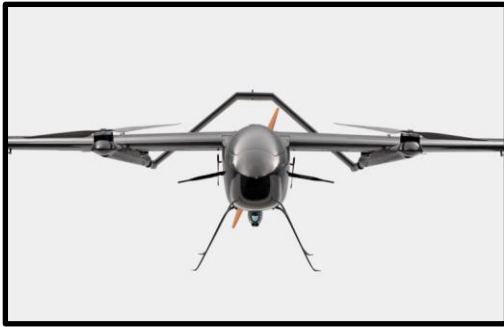
Fig;1 Aero plane like Drone

This weight is including it's pay loads also.