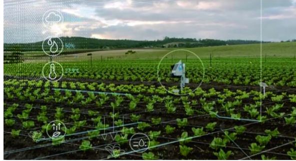
Fig.3: An automated smart irrigation system based on AI technology

The smart irrigation system is fully automated and continuously monitors the crop's water needs based on the soil content and crop requirements. The system combines Artificial Intelligence and IoT through an ANN-based setup. Using a low-cost Arduino board with various sensors, it collects and stores crop data for analysis. These sensors, including temperature, soil moisture, and humidity sensors, gather information from the agricultural field. The collected data is then compared and analyzed against standard data already stored in the system. When discrepancies are detected between real-time and standard data, the system automatically activates or deactivates the motor-pump set, enabling irrigation with drip or sprinkler methods as needed.